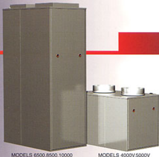
MODELS 6500, 8500, 10000