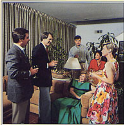
"We couldn't believe our new comfort system could cut our electric bills so drastically."

Affordable • Energy Efficient • Naturally Quieter • Dependable • Durable • Improved Performance • Maximum Cooling Comfort • Season After Season • Remarkably Reliable • Money Saving • Attractive Durable Powder Paint Finish • Rust Resistant Screws • Quality • And It's Made in the USA.